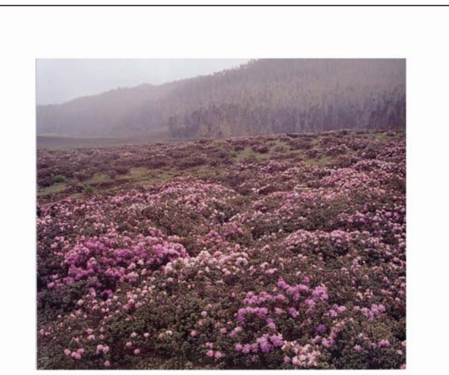
Rhododendron racemosum, Zhongdian, Yunnan

The January meeting is a time to share slides of gardens, recent hikes or trips abroad that feature rhododendrons. Members are invited to bring up to a dozen slides to the meeting.