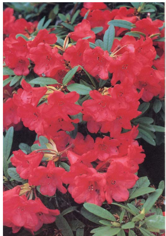
Rhododendron 'Creeping Jenny'

Plants, books, fresh eggs, etc. are always welcome!