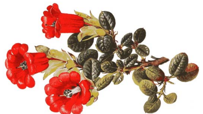
Rhododendron forrestii subsp. forrestii by Lilian Snelling. From Curtis's Botanical Magazine, 1927.