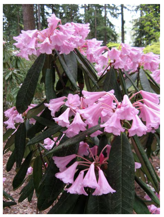
R pingianum ... RSBG, April 2010

For many decades the Floral Hall at VanDusen Botanical Gardens has been the meeting place for the VRS and many other horticultural clubs. In the fall of this year, with the completion of the new facilities at VanDusen, and the ensuing demolition of the Floral Hall, we will move into the Great Room. Although the new facility will, no doubt, be a pleasant meeting space, it is accompanied by the prospect of an increase in room rental fees, in the order of 7%. At close to $250 per night, or $1750 for the programme year, the rental fee will become the largest line item in the VRS operating budget, and account for 18% of expenses. The VRS executive is not resigned to this scenario, and we will try and negotiate an affordable rent that will allow VRS to continue to meet at VanDusen. However, faced with the possibility of the increase, we have to be responsible and proactive in exploring affordable alternative locations that will meet VRS needs, and we have begun that process. I welcome, for consideration by the executive, any suggestions or insights on this topic that you may care to submit. .....Tony Clayton, President