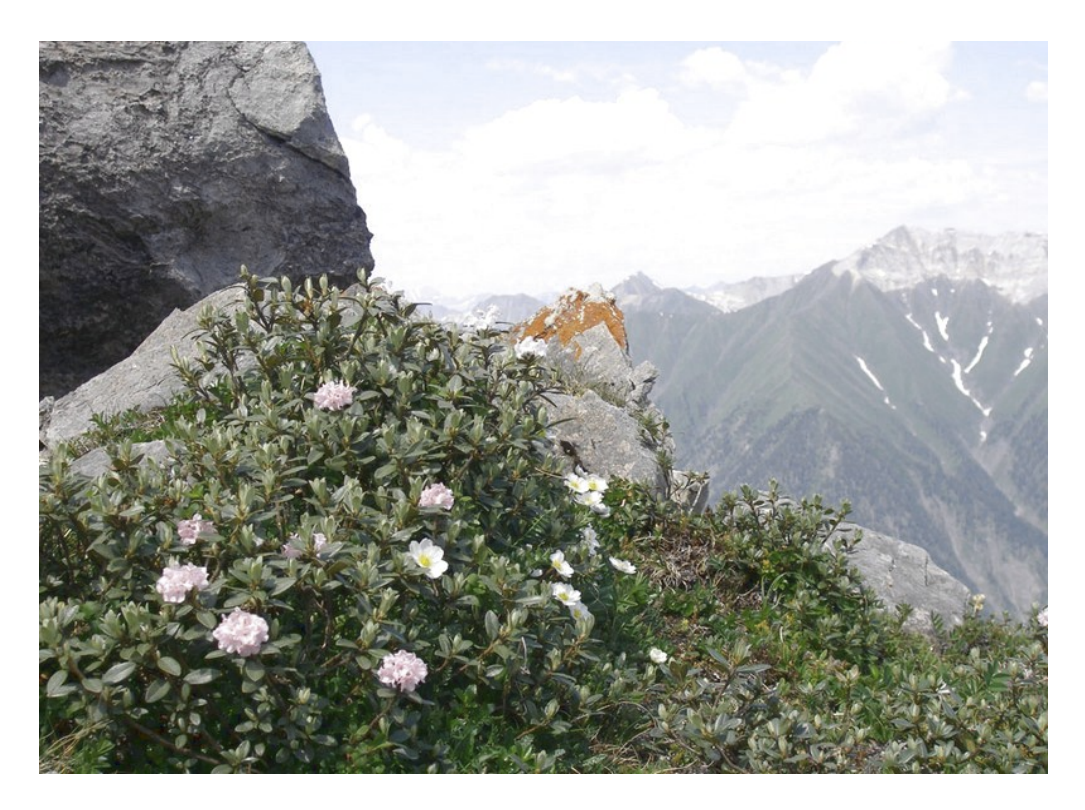
R. adamsii.