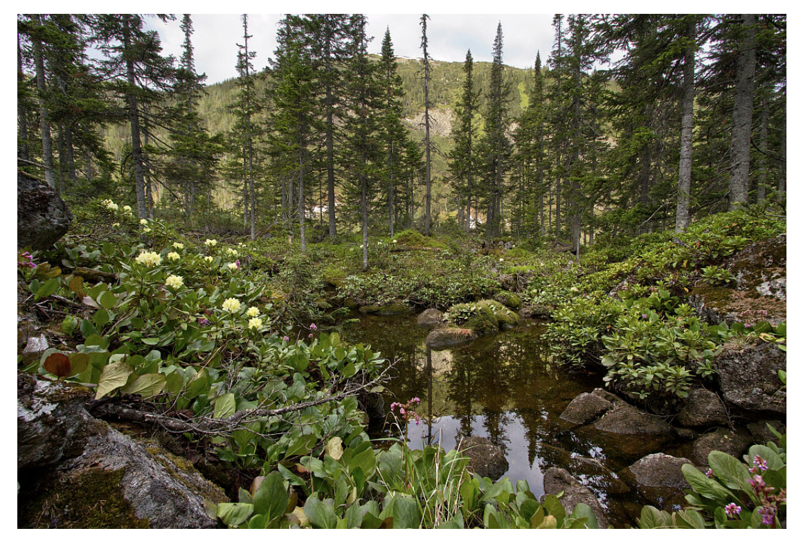
R. aureum with Siberian tea, Bergenia crassifolia, Baikal Reserve, Russia

The rhodo' is used as a tea for various disorders as is R. aureum (old syn. was R. chrysanthum ), which Steller described on several occasions. He tried it out on some ?-Musk deer that subsequently fell into a convulsive stupor for several hours.