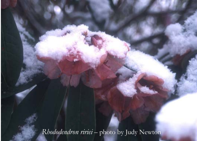
Rhododendron ririei

Until they were nearly lost under a considerable blanket of snow the other day, the “great bell” rhododendrons, R. ririei , were a major talking point amongst visitors and staff at UBC Botanical Garden. Relatively little known both here and abroad, R. ririei is a robust species, growing tall and handsome with large, glossy foliage, much like its relatives in subsection Argyrophylla .