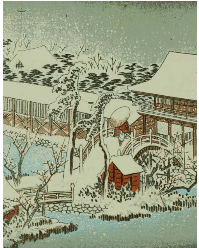
The Shinto shrine at Kameido in the falling snow Detail of a woodblock print ca. 1833-1834, by Ando Hiroshige (1797-1858)

The Whitecap catalogue (which has many categories in addition to gardening) is accessible on-line at http://www.whitecap.ca , and Whitecap is the Canadian distributor for Timber Press, another comprehensive “publisher of sophisticated books on garden