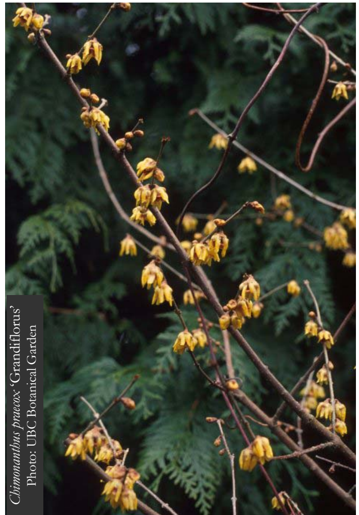
Chimonanthus praecox 'Grandiflorus'