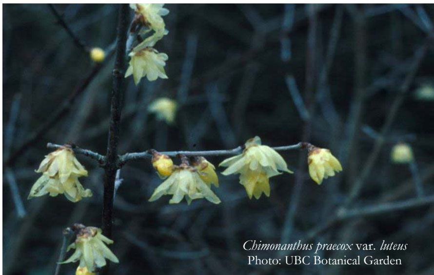
Chimonanthus praecox var. luteus