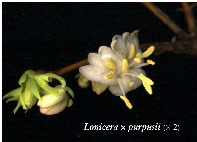
Lonicera x purpusii (× 2)

It's often said that one of the most powerful memory triggers is one's sense of smell. For me, the Christmas "smell" is that of Douglas fir, for example, because that was the species we always dragged home and decorated. Others may have similar recollections, but attach it to the fragrance of a different conifer species, depending on what was commonly available; balsam fir in eastern North America, Norway spruce or Scots pine in western Europe. An exceptionally common memory trigger is honeysuckle. Here, as in much of the